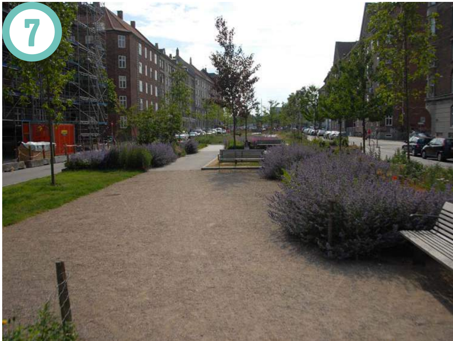
POCKET SPACES THROUGHOUT THE TOWN CENTRE